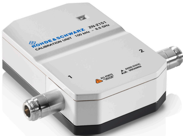
R&S®ZN-Z151 calibration unit