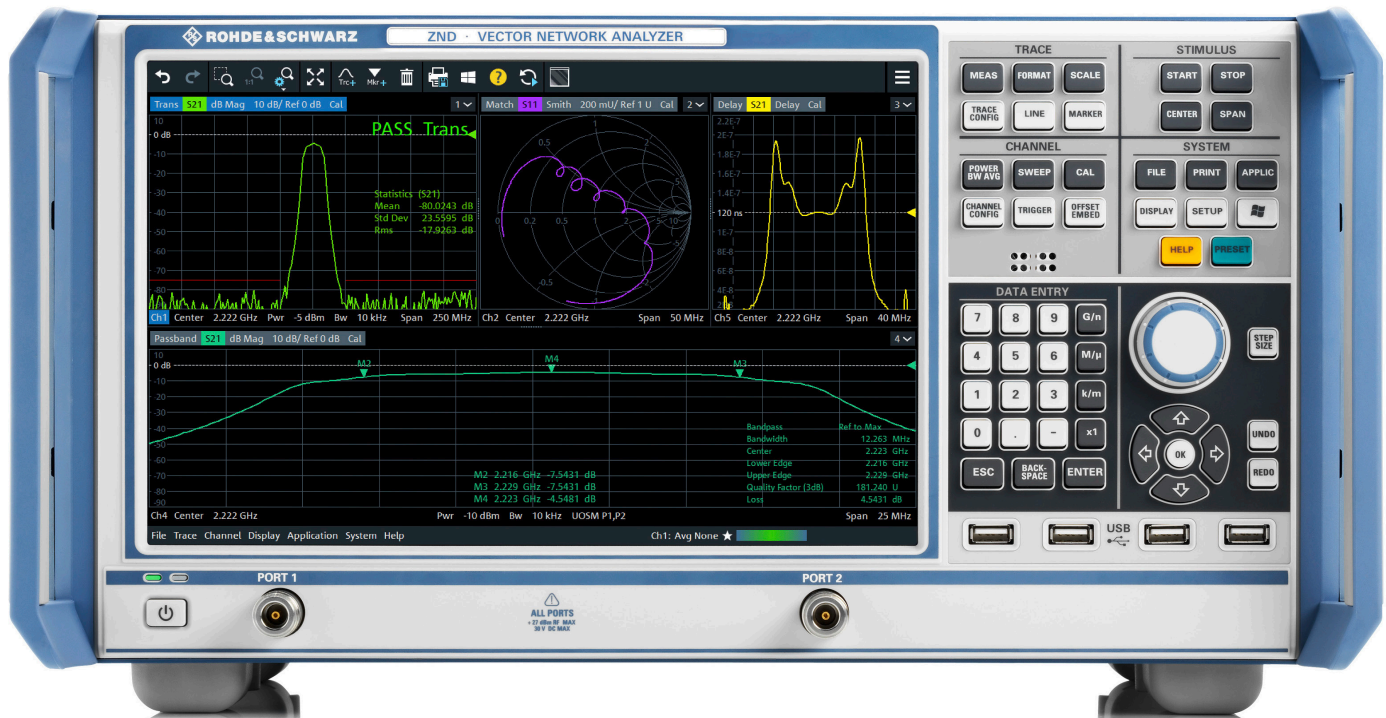
Front view of the R&S®ZND