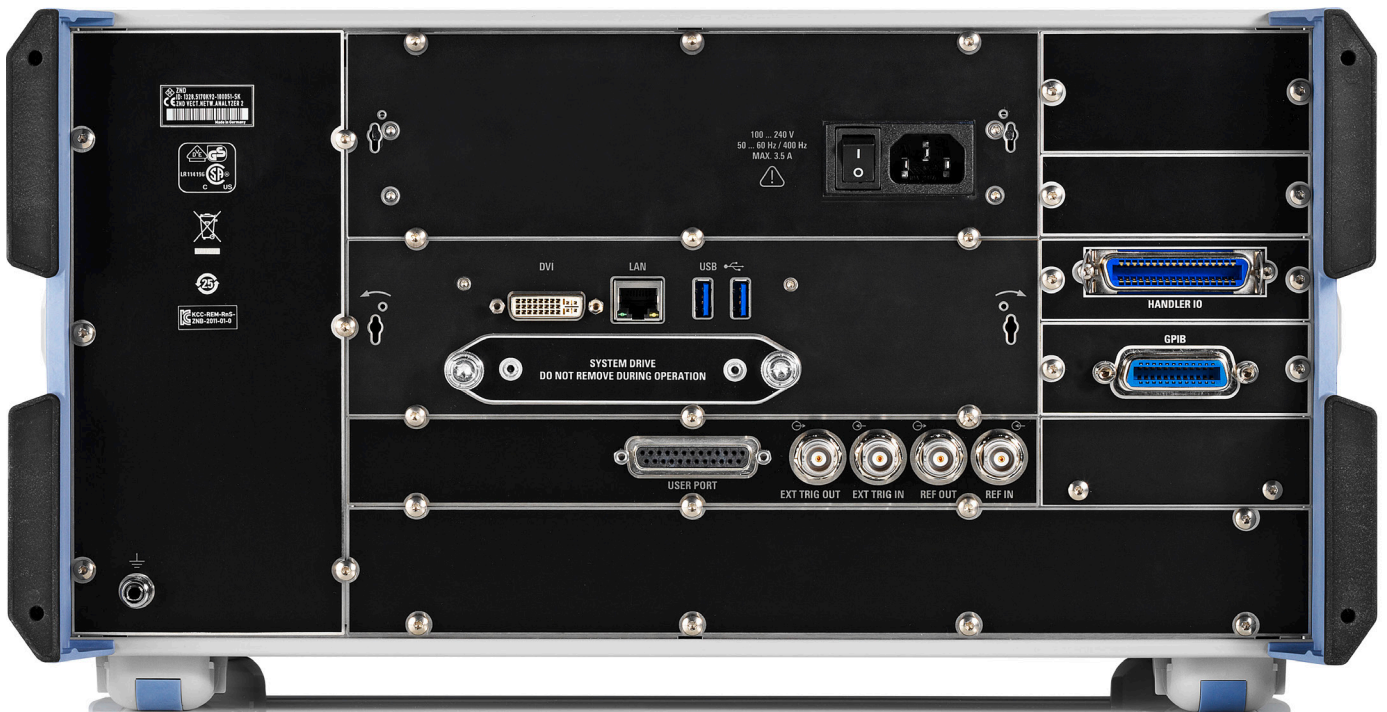
Rear view of the R&S®ZND