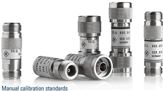
Manual calibration standards

Rohde & Schwarz offers automatic calibration units that make calibration even more convenient. These calibration units are connected via USB and are immediately ready for operation. They calibrate an R&S®ZND in less than 30 seconds, covering 201 points. Users can connect adapters to a calibration unit to match different connector types used on the DUT. They can re-characterize the calibration unit, together with the adapters, and store the resulting data to the unit's internal memory.